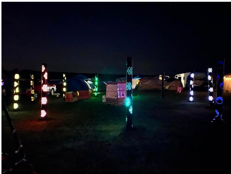
Center Camp 2023 - Photo by Glamazon