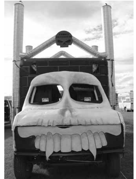
UNHOLY GRINDHOUSE IN 2016

Please do not try to run and jump onto a moving art car; instead feel free to wave, holler, dance, wiggle, or offer treats until an art car comes to a complete stop and invites you aboard. If you'd like to get off of a moving vehicle, ask the driver to stop first.