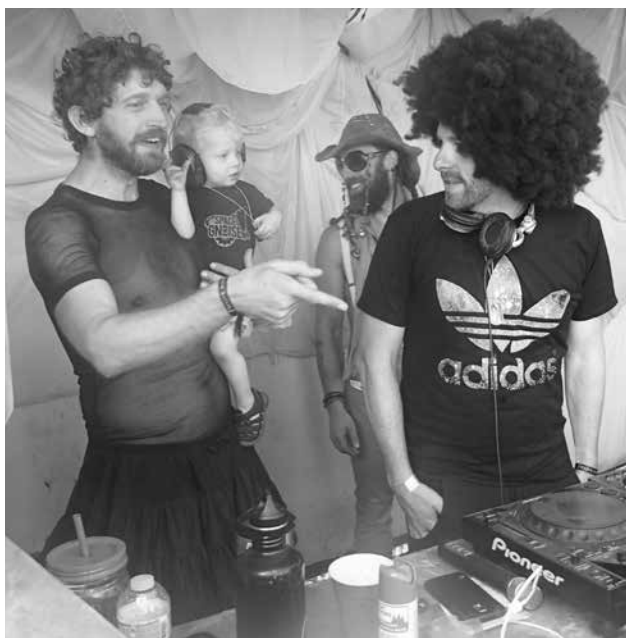
KIDS OF ALL AGES AT FREEZER BURN 2016