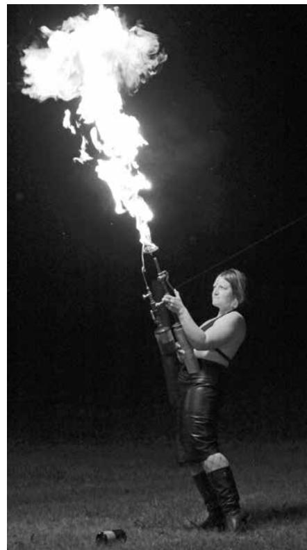
FIRE CONCLAVE, FREEZER BURN 2016