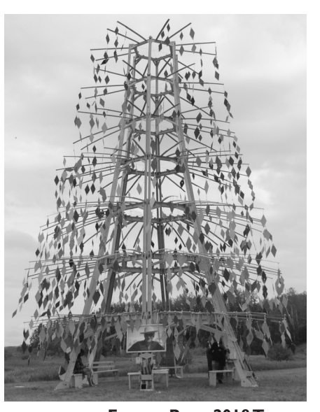
FREEZER BURN 2018 TEMPLE

Please respect the time and effort to build the art piece. Refrain from climbing (unless otherwise instructed). Do not smoke near, use open flame, or otherwise intentionally damage the Effigy.