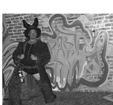
ONE OF OUR FEARLESS LNT TEAM LEADS