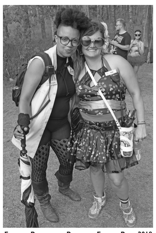
FRIENDLY RANGERS ON PATROL AT FREEZER BURN 2018