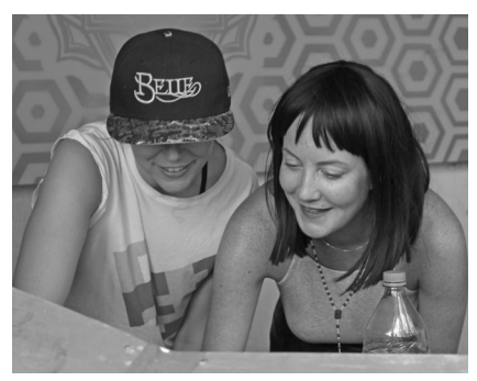
DJs Playing at Freezer Burn 2018