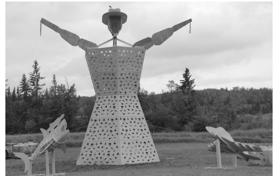
FREEZER BURN 2018 EFFIGY