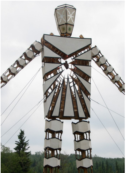
FREEZER BURN 2019 EFFTGY