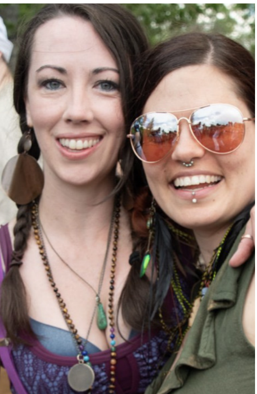
FREEZER BURN 2022