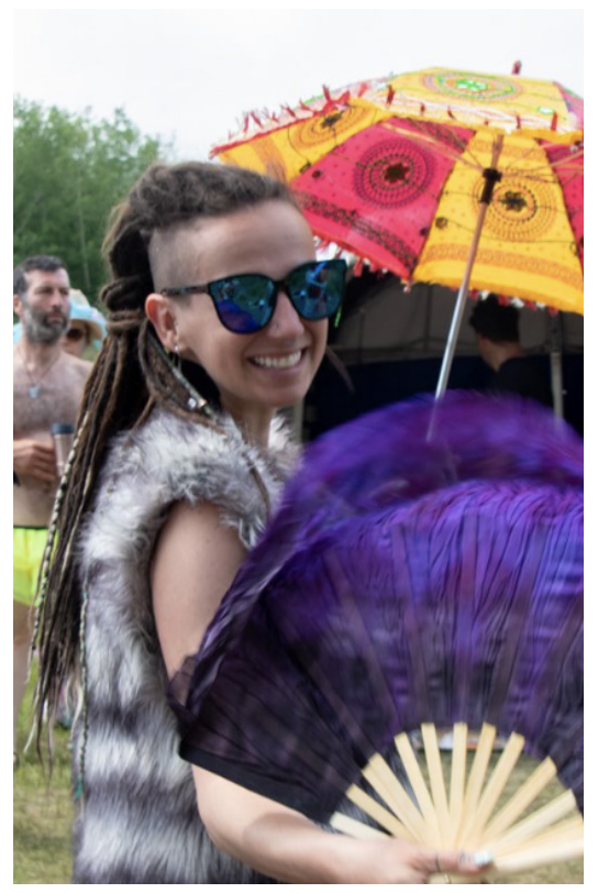
FREEZER BURN 2022