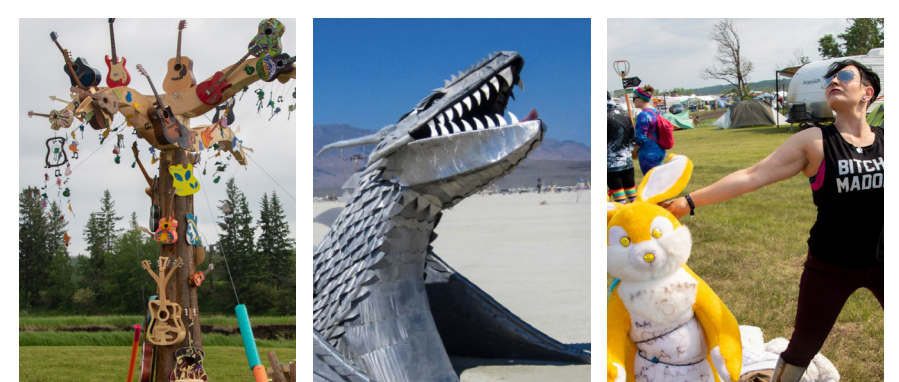
FREEZER BURN 2019 FIRT