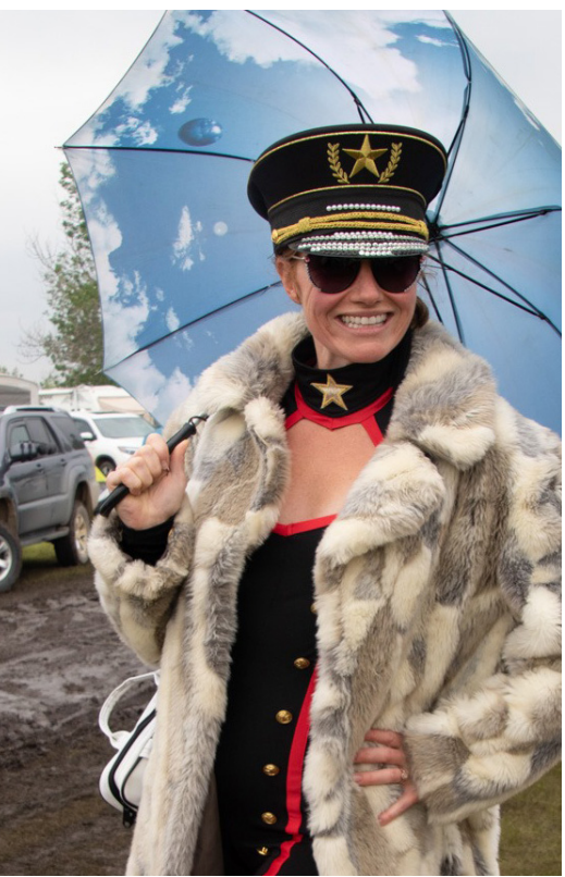
FREEZER BURN 2022