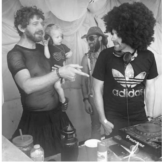
KIDS OF ALL AGES AT FREEZER BURN 2016

Although children 12 and under enter for free, they should be registered prior to arriving at the Gate by emailing freezerburntickets@gmail.com by June 15.