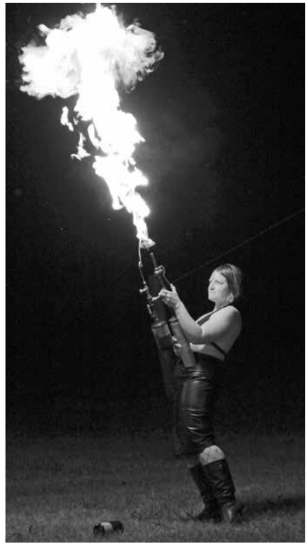
FIRE CONCLAVE, FREEZER BURN 2016