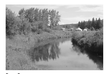
BATTLE RIVER: WATCH FOR WATER LEVELS AND CHILDREN NEAR IT