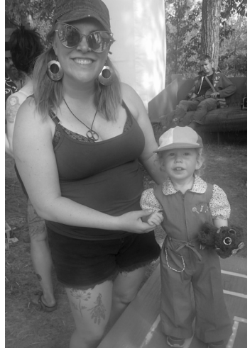
FUNK JAM FAMILY FUN AT FREEZER BURN 2017