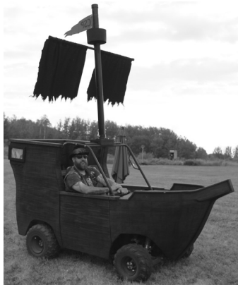
THE TRAGICALLY SHIP ART CAR

Please do not try to run and jump onto a moving art car; instead feel free to wave, holler, dance, wiggle, or offer treats until an art car comes to a complete stop and invites you aboard. If you'd like to get off of a moving vehicle, ask the driver to stop first.