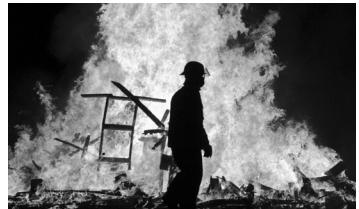
RESPECT PERIMETER VOLUNTEERS

Remember that most Fraya costumes and fire do not mix! Be careful with fancy costumes around open flames.