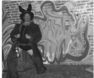
ONE OF OUR FEARLESS LNT TEAM LEADS