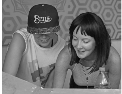
DJs PLAYING AT FREEZER BURN 2018