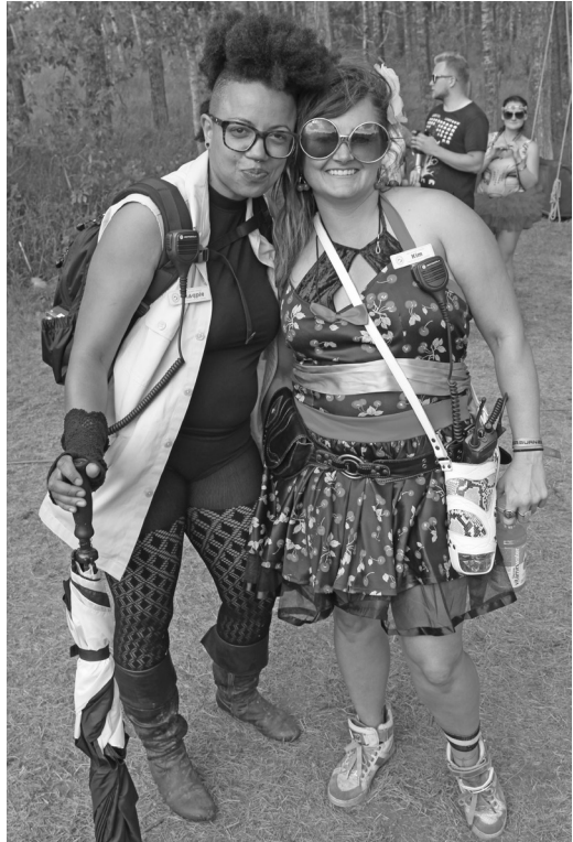
FRIENDLY RANGERS ON PATROL AT FREEZER BURN 2018