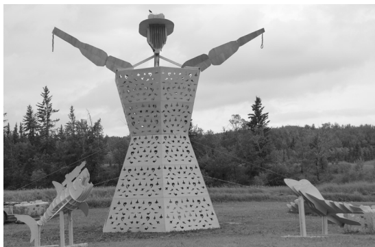
FREEZER BURN 2018 EFFIGY