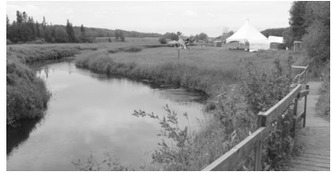
BATTLE RIVER RUNS ALONG THE FRAYA